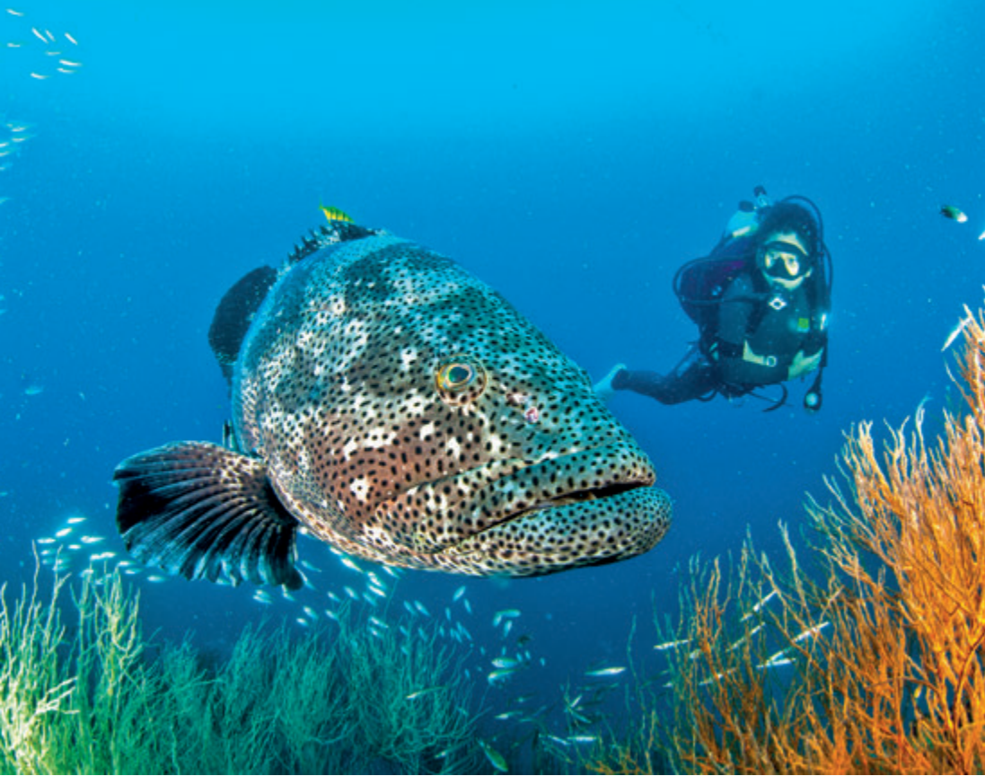
Kong Hin Chumphon

Laem Ta To (แหลมตาโต๊ะ) is a viewpoint on the mountaintop, overlooking the scenery of Ao Thian Ok and Ao Chalok Ban Kao. There are coconut plantations interspersed with rocks.