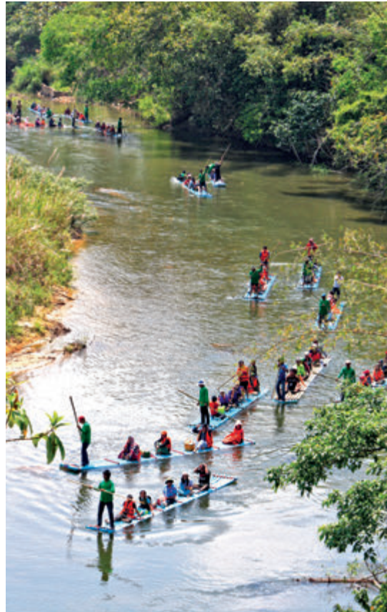
Phato Canal Water Rafting

Ao Luek (อ่าวลึก) is a bay located to the southeast, surrounded by cliffs. There is a beautiful rocky cape and a coral diving site.