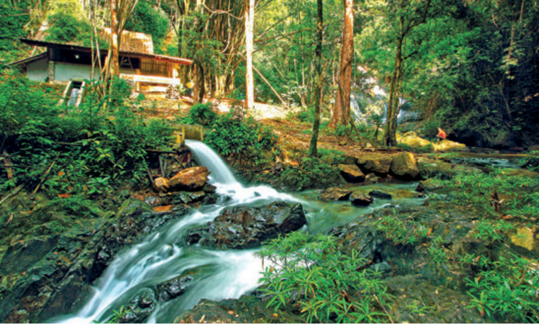
Ban Khlong Ruea Homestay