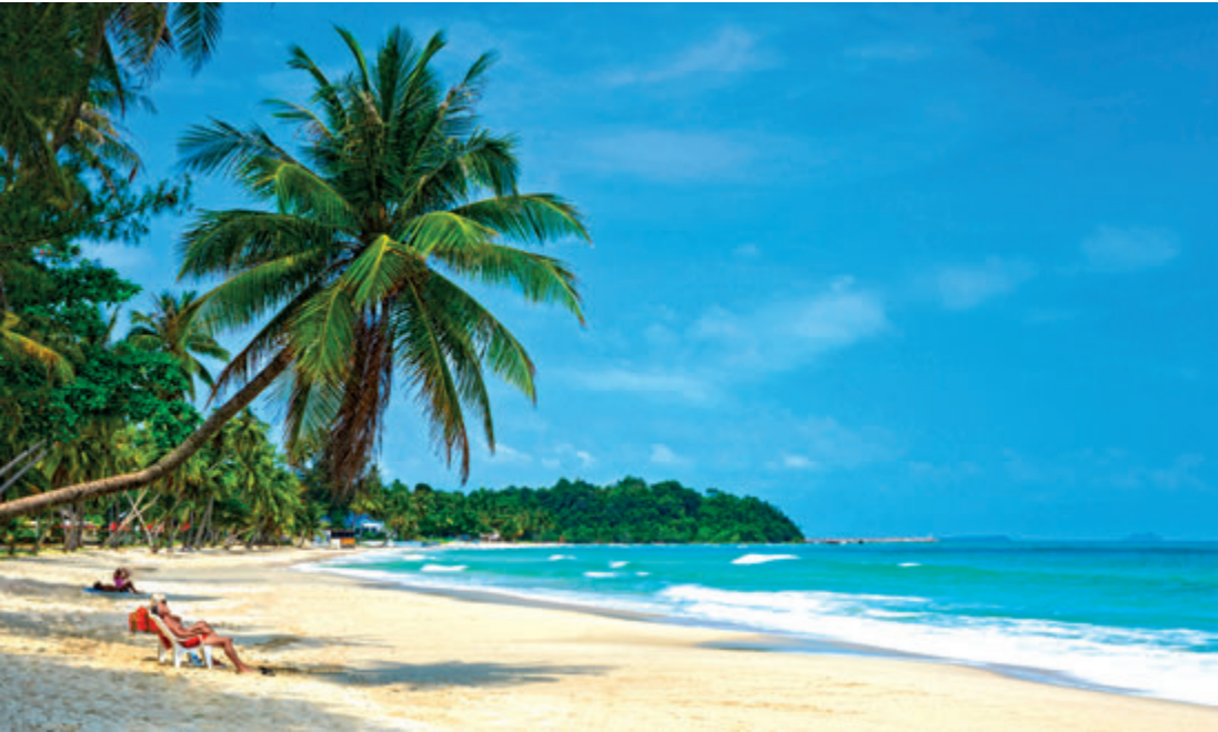
Hat Thung Wua Laen