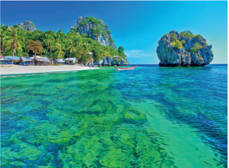
Ko Langka Chio

Ko Langka Chio (เกาะลังกาจิว) This white sandy beach island is a bird's nest concessionary island, located at least 8 kilometres away from Thung Makham bay. There are no habitations on the island except for the hut of the bird's nest inspector. Another interesting point of this Langka Jiew island is that the signature of