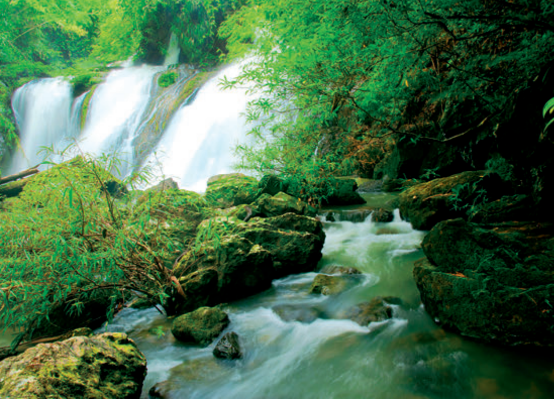
Namtok Heo Phlu Nang

the biological diversity, consists of variety of wild animals and plants especially ferns, and orchids. Some fascinating waterfall such as Heo Phlu Nung and Heo Ta Chan waterfall are also situated here. Moreover, for visitors who love to spend the time on activities should not missed visiting fruits and java gardens, bamboo rafting and bird watching etc. For more information, please call Tel. 08 7884 5267 www.klongrua.com