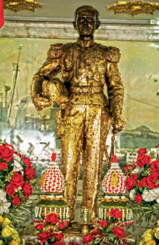
Prince of Chumphon Shrine

period around 1844. The festival, commencing annually in October after Thod Ka Thin festival (to observe the annual ceremony of presenting yellow robes to Buddhist Monks festival) at Lang Suan River. The main activity is the boat procession from various temples and boat racing. The winner is the one who get the flag at the finish line with out sinking. For more information, please contact Lang Suan District Office Tel. 0 7754 1009