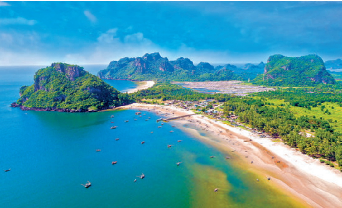
Hat Tham Thong-Bang Boet

Situated at Mu 4, Tambon Tha Kham. The temple is approximately 4 kilometres from