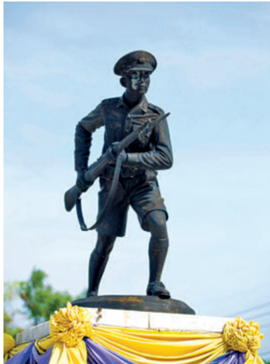
Military Youth Monument

is located on Highway No. 4001 (Chumphon-Pak Nam), Tambon Bang Mak, close to Tha Nang Sung bridge. It is about 5 kilometres away from the city. This monument is built to commemorate the bravery of military youth for their fight against the Japanese troop in 1941 during the Worldwar II.