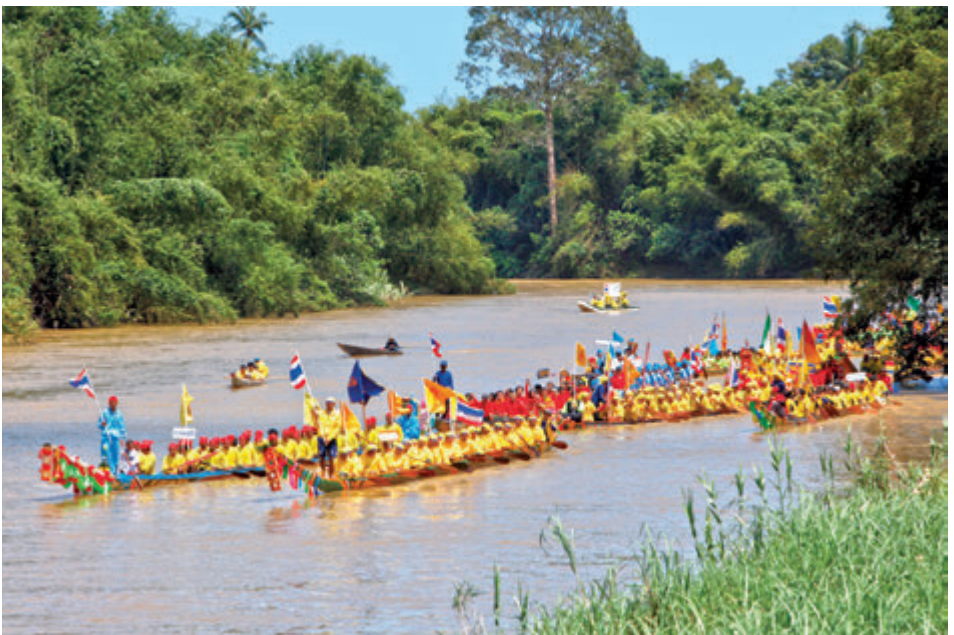
Traditional Boats Procession and Boat Racing

Originally this event began in King Rama III's