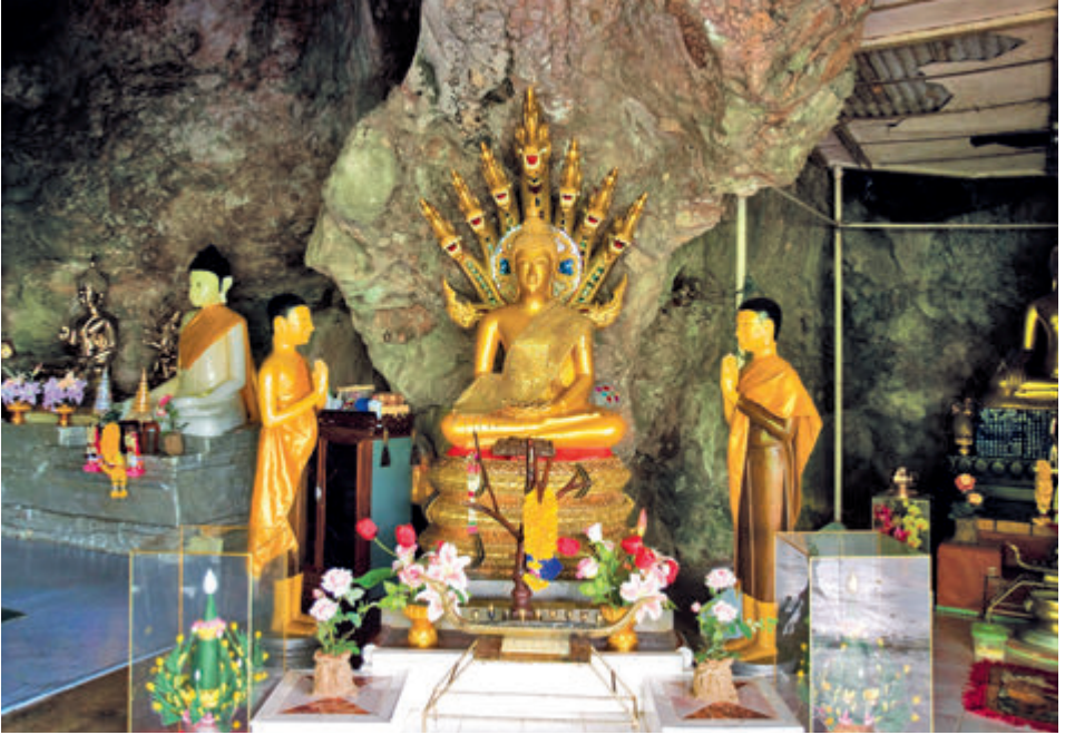
Wat Phrathat Tham Khwan Mueang

Phet Kasem road (Highway No.4), at Km. 490. The Phrae Charoen temple is announced as the National Archaeological Site on 27 September 1936. The temple is located at the foot of Rap Ro hill where used to be the U-thum Phon ancient city location, Rak Sa Dan seaport town with an old Buddha image which local villagers called "Luang Pu Lak" and 577 Subduing Mara Attitude Buddha images inside the cave. Ai Te Cave is located next to Rup Ro Cave, there are an un-finished reclining Buddha fresco painting on the wall. Moreover, there is Sai Cave where used to be the resident of the superior, consists of beautiful stalactites and stalactites. On the area of Samakki house, there are the Buddha footprint and a body of Lung Pu Sai which was not yet decayed. Near by are the local museum with the collections of the ancient materials and the leather carving of the shadow puppet show.