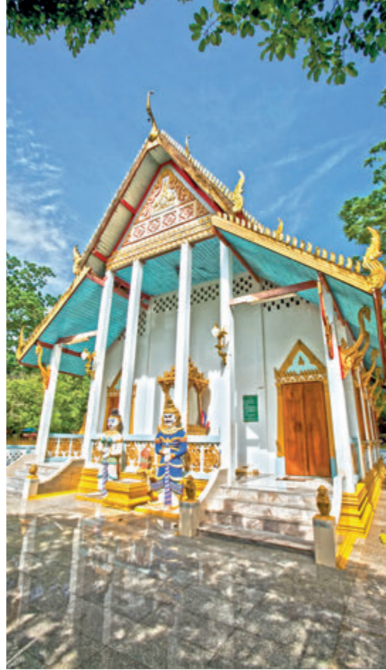
Wat Chao Fa Sala Loi

-Chumphon-Ranong, take van services at Tha Tapao Road Tel. 0 7757 0643.