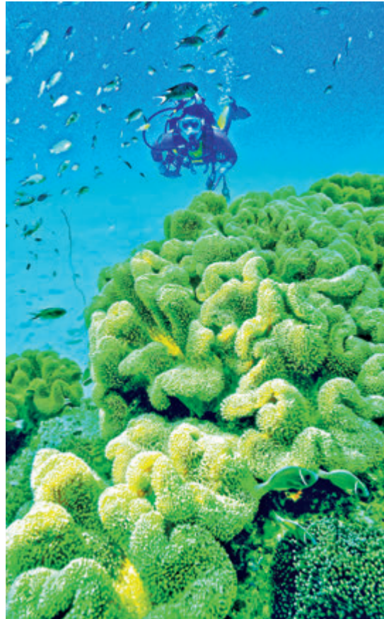
Coral Reef, Ko Ngam Yai

is located at Mu 3, Tambon Chumkho. Starts from Highway No. 4 on Phetkasem road (Chumphon-Pathio road), take Highway No. 3201 until reached the guidepost at Tambon Chumkho area. The area is covered with limestone mountain range in beautiful shape, parallel to the road. This is the habitat of 3 flocks