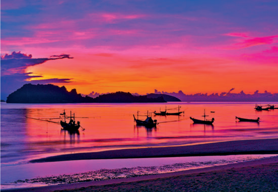
Hat Sai Ri, Muko Chumphon National Park

Chumphon National Park Natural Learning Centre and the scenery point where a panoramic view of the various islands can be viewed.