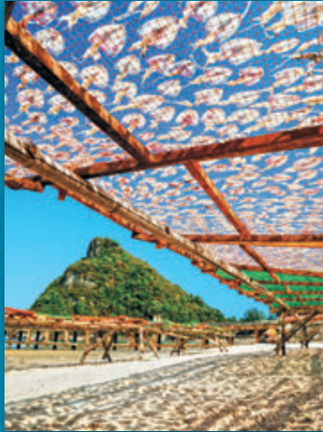
Ao Tham Thong-Bang Boet Fisherman Village