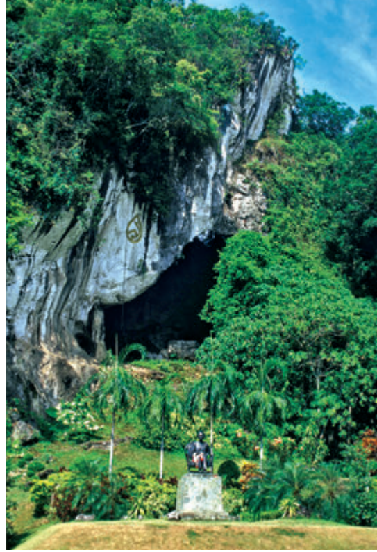
Somdet Phra Srinagarindra Park

To get there: This waterfall is located 23 kilometres away from Amphoe Thung Tako by taking Highway No. 41 (Thung Tako-Lang Suan Route) at Km. 57-58. There is the junction at 10 kilometres before reaching Amphoe Lang Suan. Take a right turn and get on the asphalted road, there is a sign shows the way