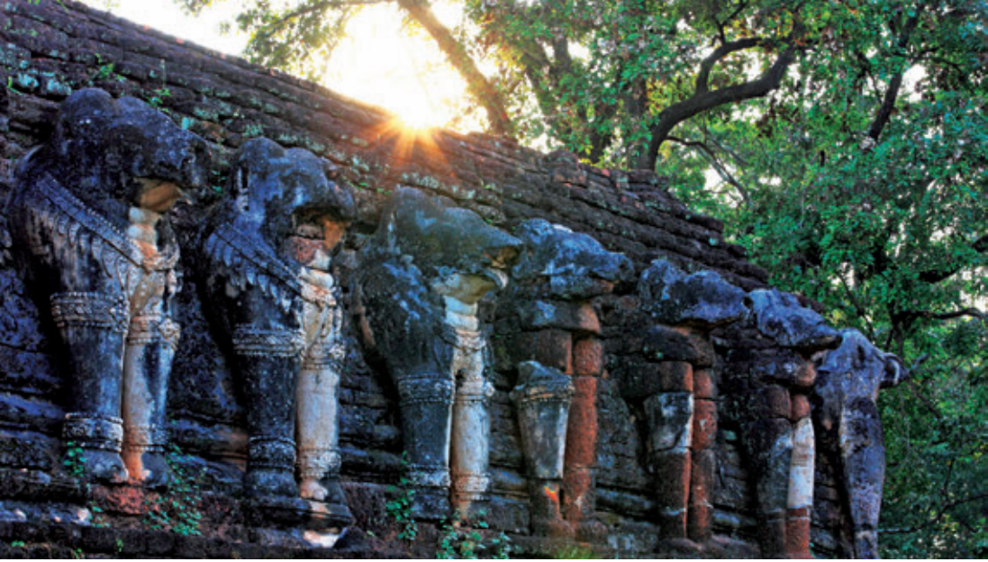
Wat Chang Rop

principal monument is cruciform mondop facing 4 directions, each of which is faced by a Buddha images of 4 different gestures; namely, walking, sitting, standing and reclining. Only the immense standing Buddha image still remains at present. The image features a face of the Kamphaeng Phet school of Sukhothai art, i.e. having a wide forehead and tapering chin.