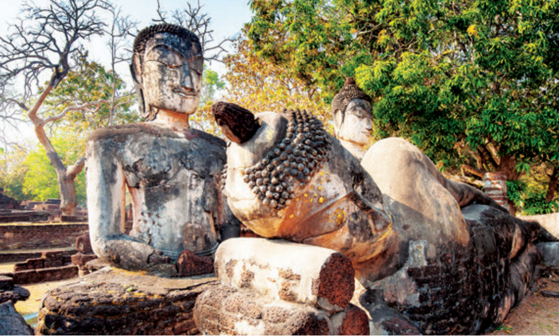
Wat Phra Kaeo

which belonged to Nakhon Chum town were built out of brick and were of smaller scales. However, there is a common artistic style that reflects a blend of contemporary Sukhothai and Ayutthaya arts. A number of ancient monuments can also be found in the outskirts 2 kilometres to the northwest of Kamphaeng Phet town in the so-called 'Aranyik Area' where forest-dwelling monks stayed and practised meditation for their insight development. The Kamphaeng Phet Historical Park, together with Sukhothai Historical Park and Si Satchanalai Historical Park, were combinedly proclaimed a World Heritage Site by UNESCO on 12 December, 1991. It is open from 8.00 a.m.-5.00 p.m. Admission is Bt 100/person and an additional fee of Bt 50/car will be charged for visitors driving a personal car. For more information, Tel. 0 5585 4736-7