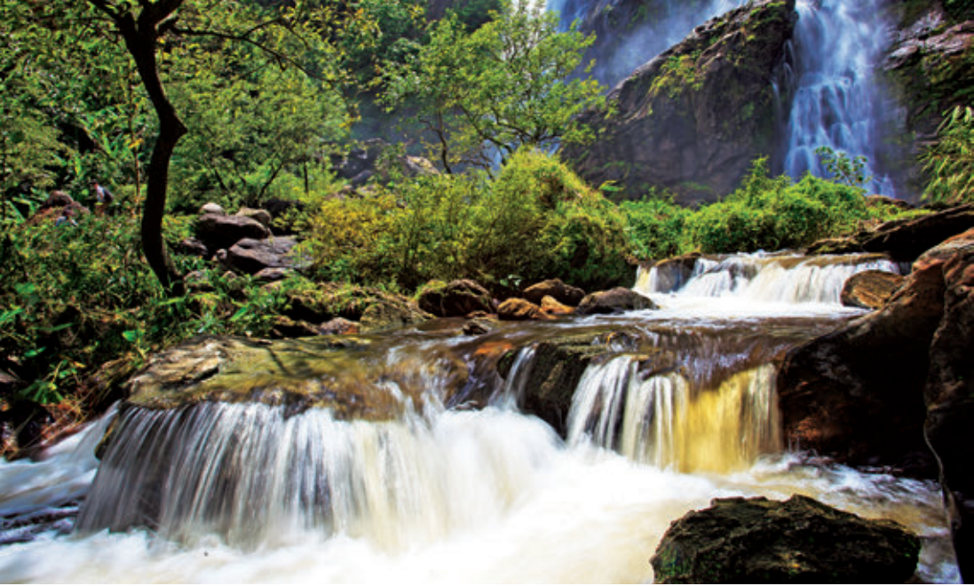
Khlong Lan Waterfall

flows down from a 100-metres-high and 40-metre-wide cascade. Below the waterfall is a basin where visitors can swim. It is 4 kilometres from Talat Khlong Lan.