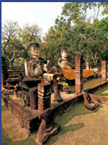
Wat Phra Kaeo