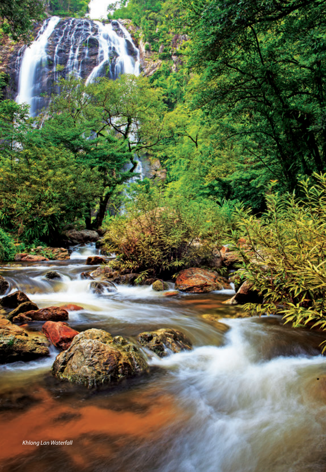
Khlong Lan Waterfall