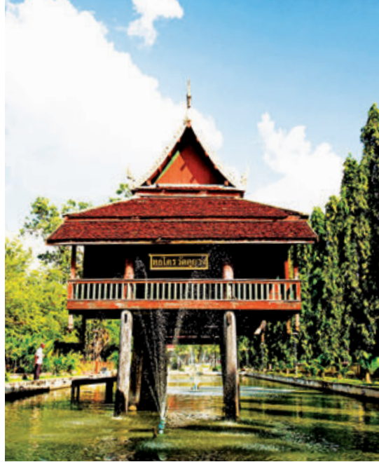
The Scripture Hall of Wat Khu Yang

is on Thesa Road within the Mueang Municipality Area. It is a fortune of a Kamphaeng Phet