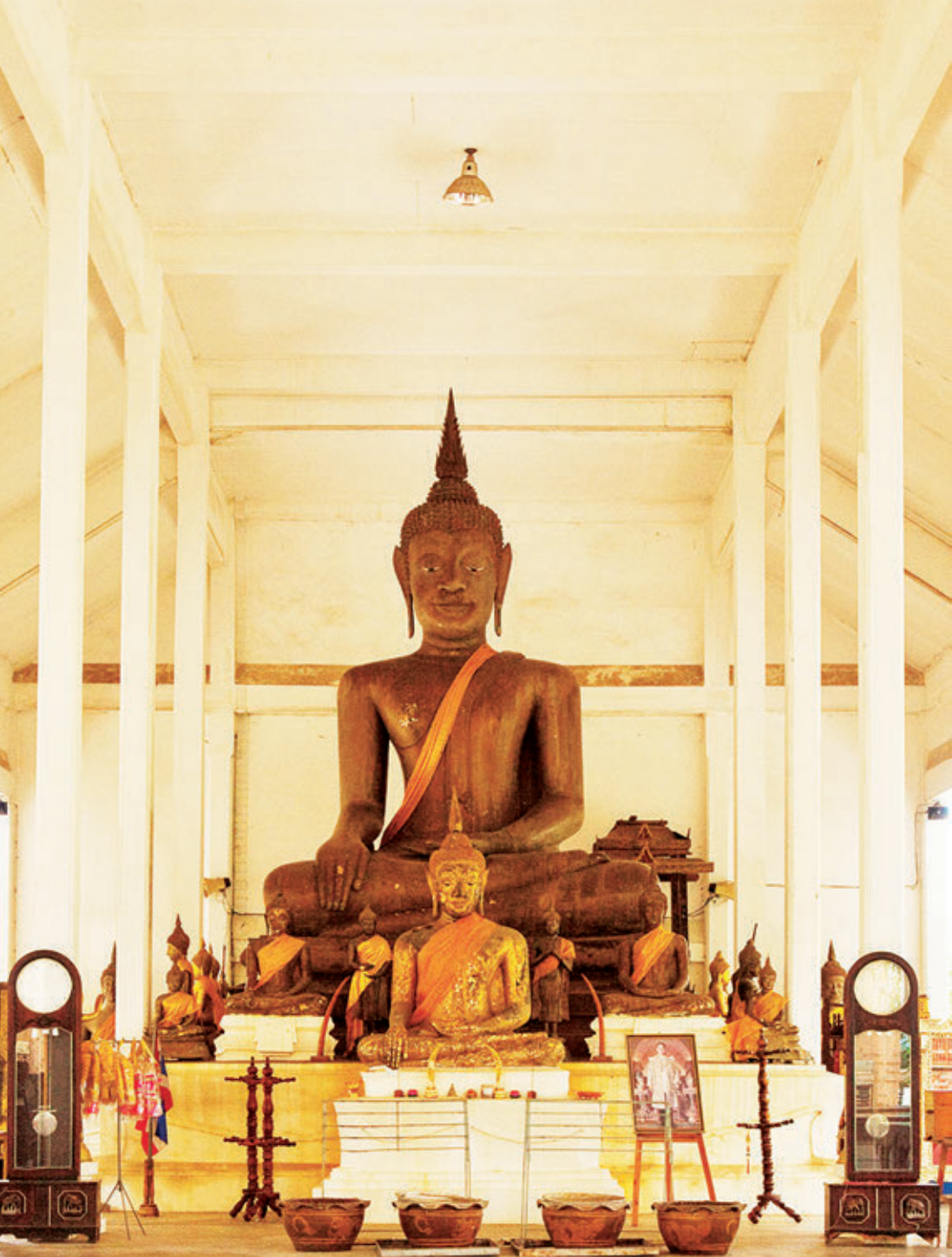
Wat Khu Yang