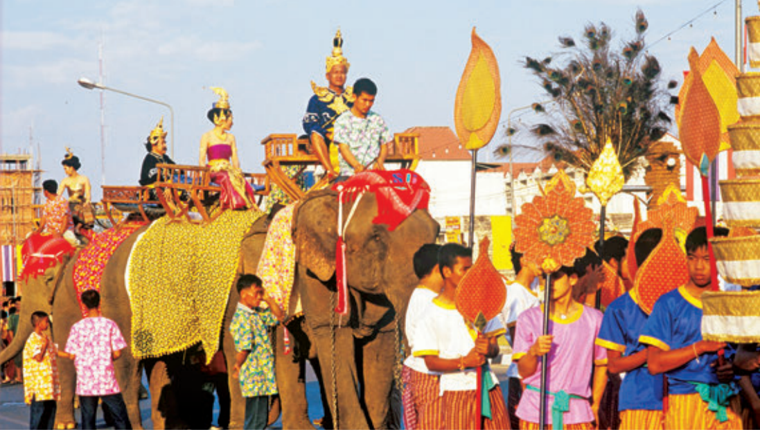
Nop Phra-Len Phleng Festival

local communities participate through the organisation of home stay accommodation for tourists. Visitors will have an opportunity to experience the lifestyle of the hilltribe villages, to witness the performances of the Lahu tribe, as well as, take a forest trekking trip.