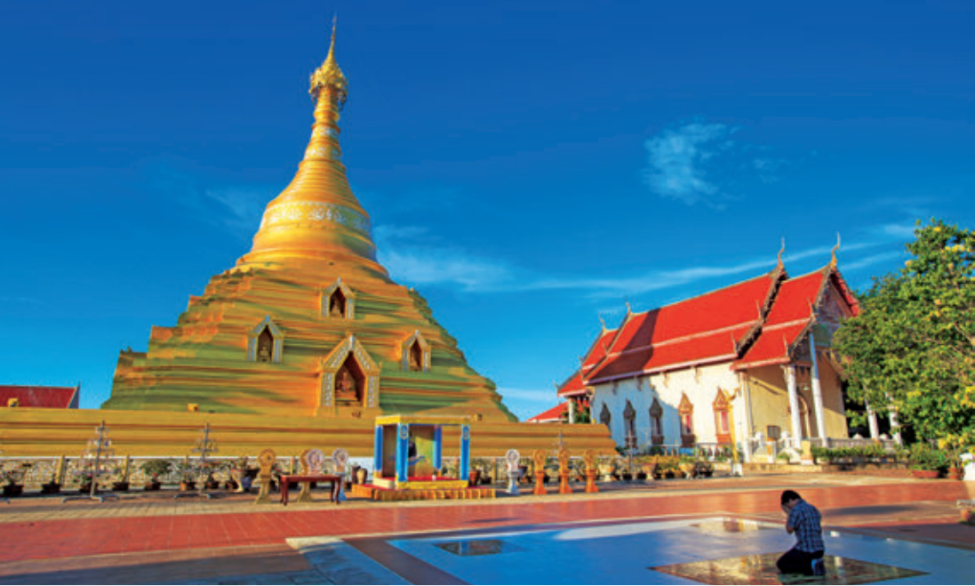
Wat Phra Borommathat Chediaram

Sa Mon (สระมน) is a square pond of approximately 16 metres wide surrounded by a moat and mound. From an archaeological excavation, roof tiles, tools and utensils, as well as ornaments were discovered.