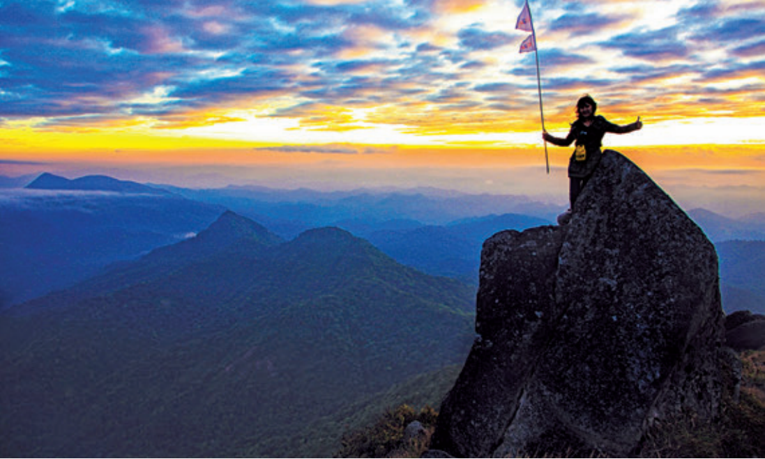
Mo Ko Chu Summit

trekking and mountain climbing would like to visit once to the height of 1,964 metres. The word “Mo Ko Chu” is in Karen language meaning “seems to rain” because the area is always covered with clouds and fog with a cool temperature. Those who are interested in experiencing the Mo Ko Chu Summit have to prepare themselves because they have to walk up a slope of not less than 60 degrees. A round trip takes 5 days and staying overnight can be done at certain allowed spots. Moreover, the condition of the route and the climate has to be studied prior to the visit. Please contact a ranger for a leader in advance at the National Park Office. The period when it is open to ascend to the summit is during October-June of every year.