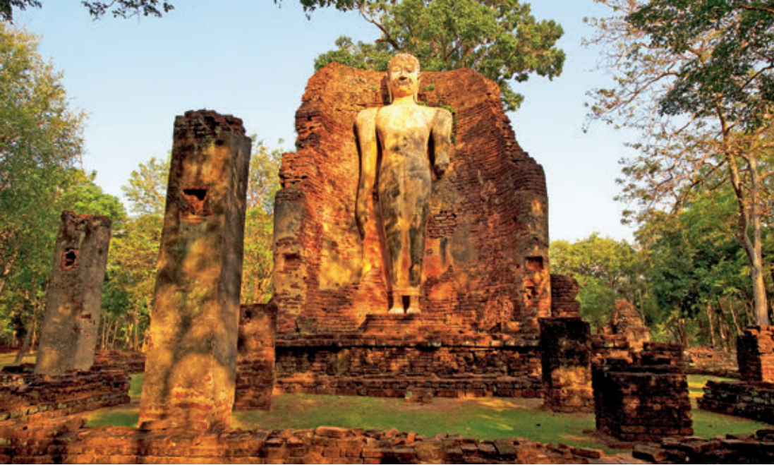
Wat Phra Si Iriyabot

Unfortunately, the northern wall was demolished.